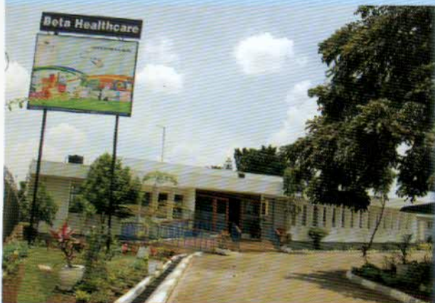
New BETA Healthcare International Administration Block