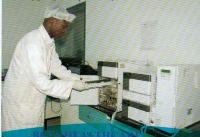
HPLC Equipment for BETA products analysis