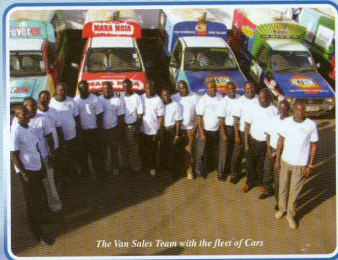
The Van Sales Team with the fleet of Cars

Beta healthcare was awarded superbrands in 2007 for its brands Action and Maramoja