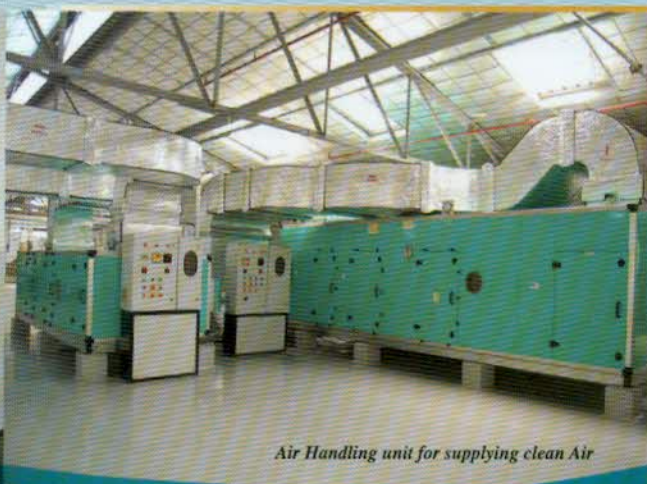
Air Handling unit for supplying clean Air