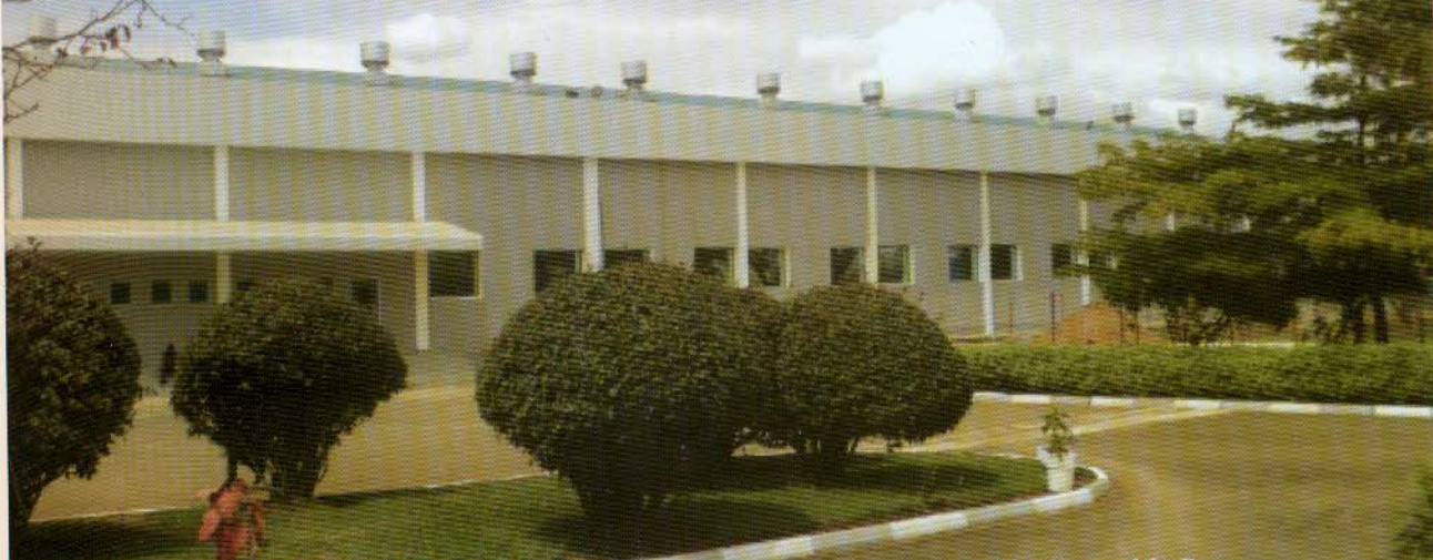
A landscape of the Factory